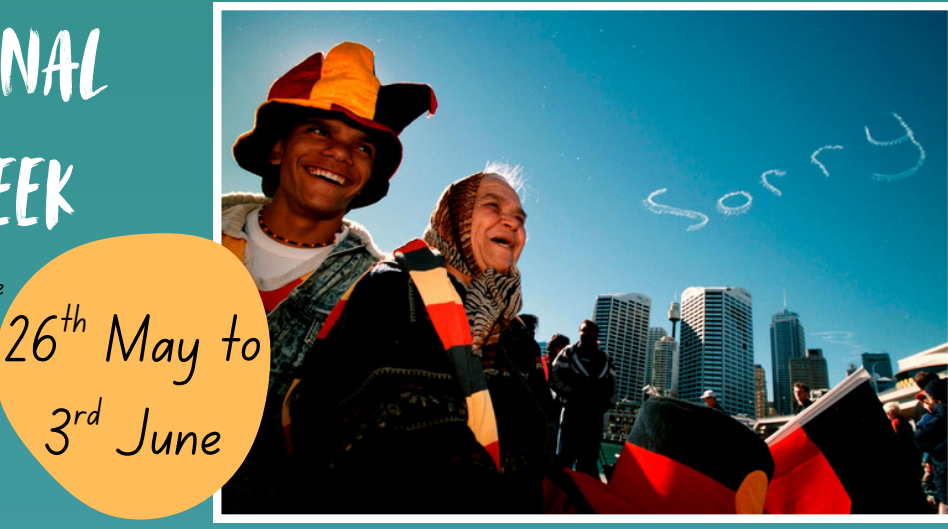
Click link for more information

We would like to Acknowledge and pay our respects to the Traditional Custodians of the land we work and live on. We would like to extend that Acknowledgment to their Elders, past, present and emerging and thank them for allowing us to work together, share knowledge and walk alongside them in the education of our Jarjum.